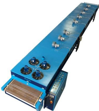
☞ IR and hot air dryer model COMBI