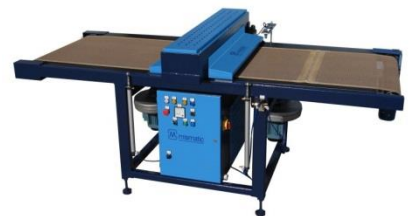
UV dryer model MINI ☞