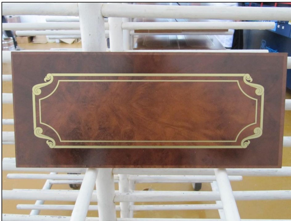
printed drawer in two colours (dark brown and gold)

To improve the quality of the product, the Mismatic Company can effect modifications in the manufacturing without any obligation to notify these to the Customer.