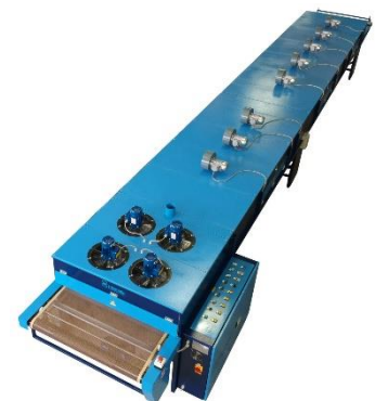
IR and hot air dryer ☞ model COMBI