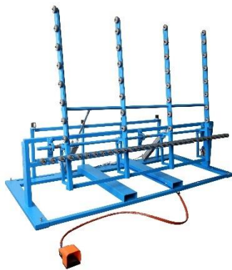
☞ pneumatic tilting table