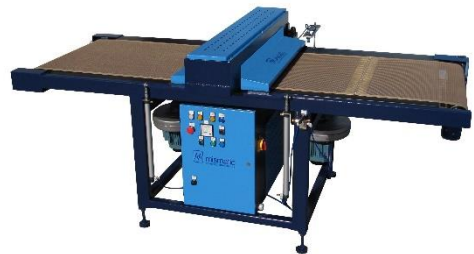
UV dryer ↻ model MINI