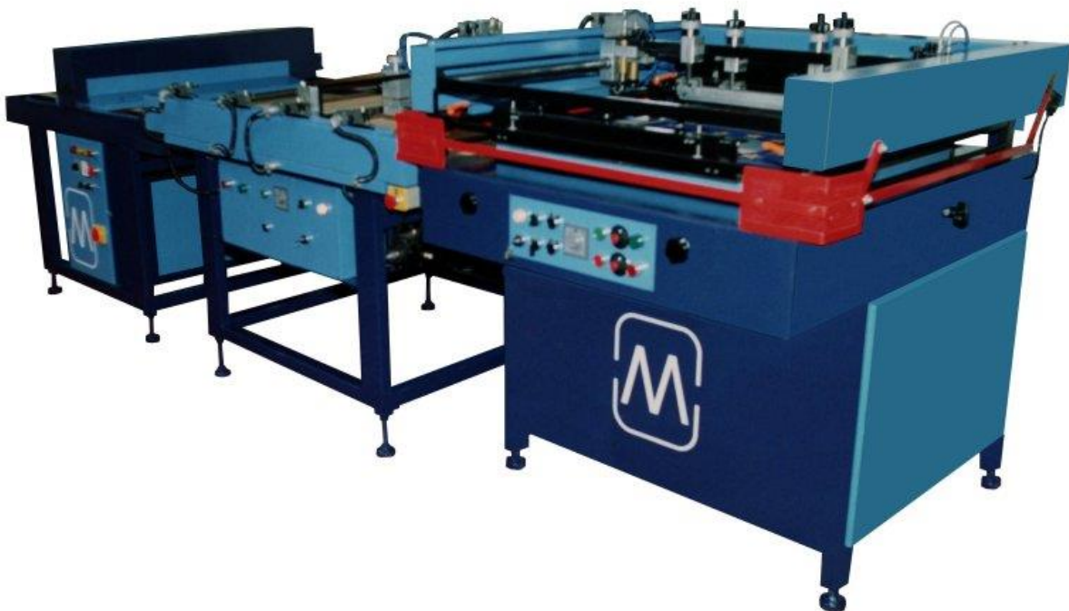
semiautomatic screen printing machine model ECO MATIC 819 + automatic off-feeder model LVF 819 + one lamp UV dryer model MINI

To improve the quality of the product, the Mismatic Company can do modifications in the manufacturing without any obligation to notify the same to the Customer.