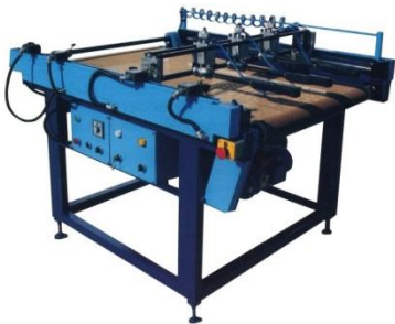
↻ automatic off-feeder model LVF 819